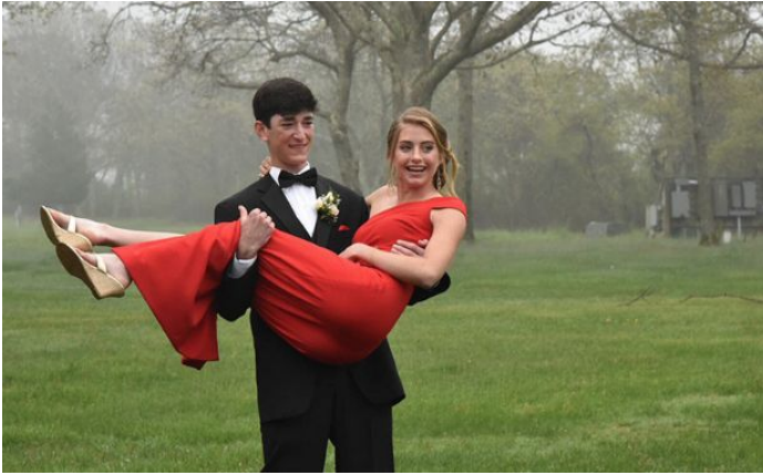
Prom 2018 photo...