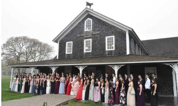
Last year prom photo!