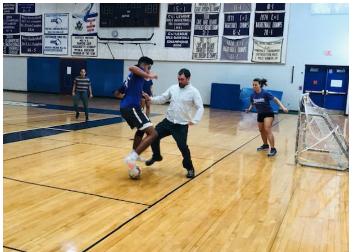
Action shot from a recent May Cup 4 v4 game!